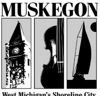
West Michigan's Shoreline City www.shorelinecity.com