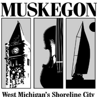
West Michigan's Shoreline City www.shorelinecity.com